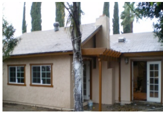
Back of the house