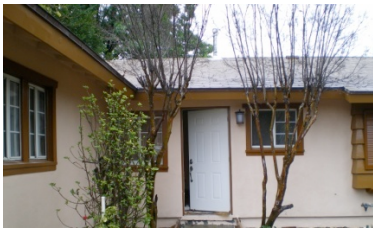
Front of the house